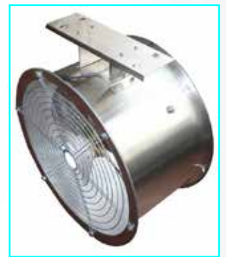
Completed with Mount Bracket